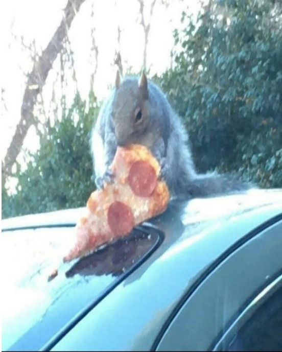
My spirit animal found me today